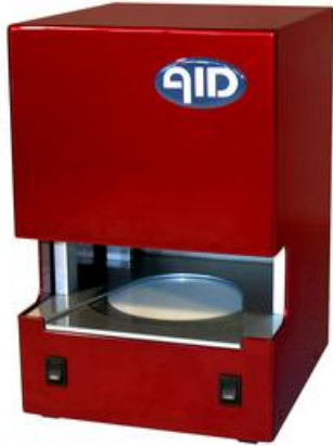
1. Manual system